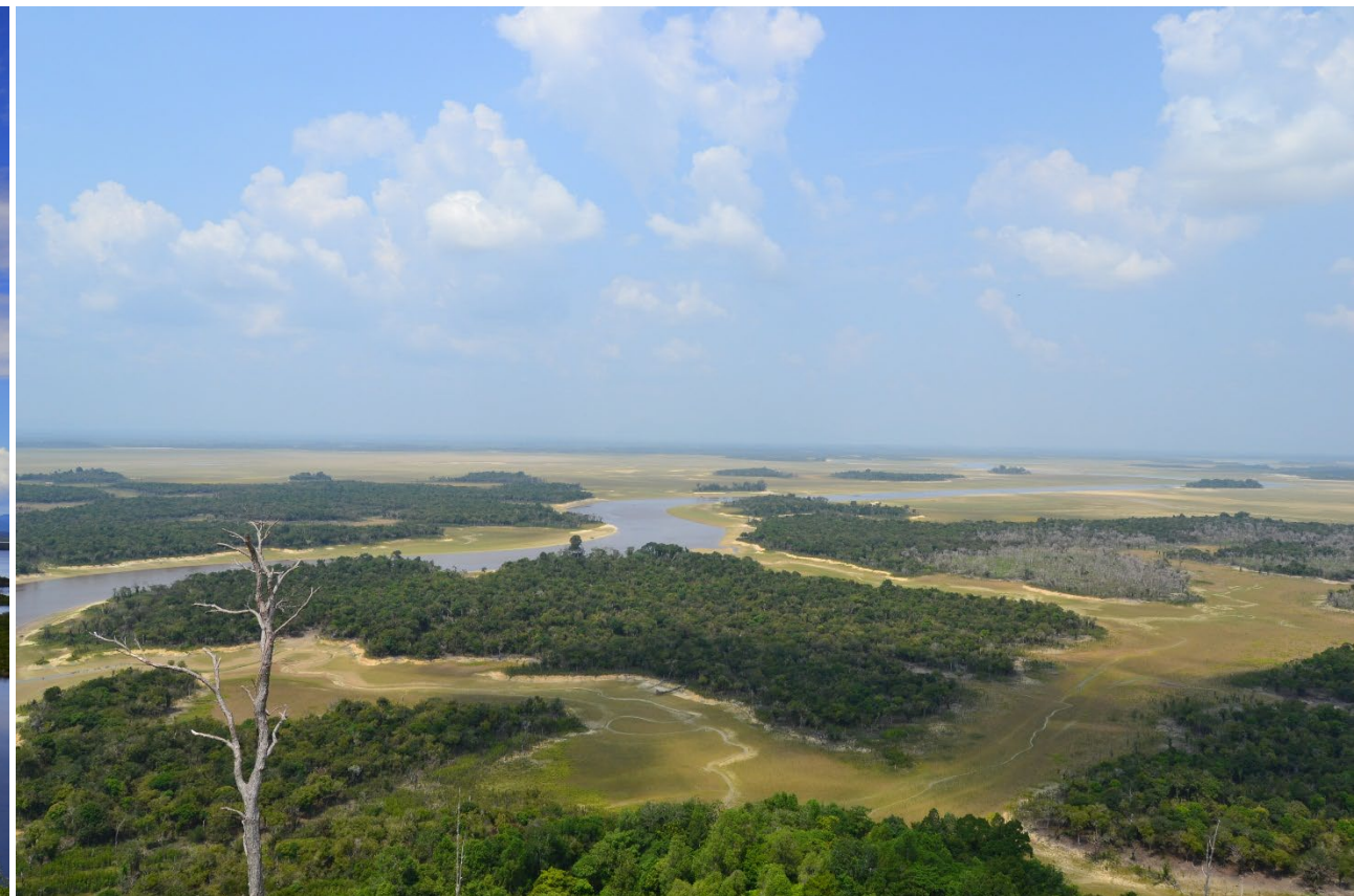
TN. Danau Sentarum, Kalbar. Gambar sebelah kiri saat musim hujan dan sebelah kanan saat musim kemarau.